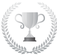
Most Likely to be in a Movie