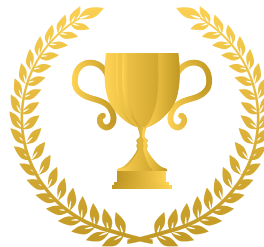
Best in Show